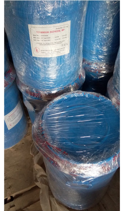
HM-HDPE Drums with Shrink wrapping & Printed Tape