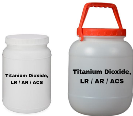
1 Kg 5 Kgs. Plastic Jar