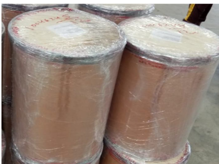
25 Kgs. Fibre Drums with Shrink wrapping and Printed Tape