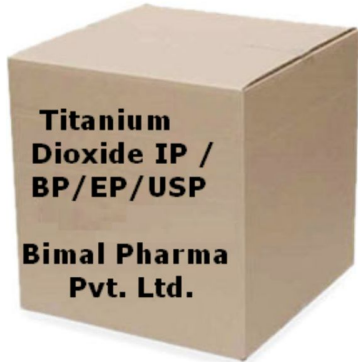
5 Kgs. Carton with PE Liner inside