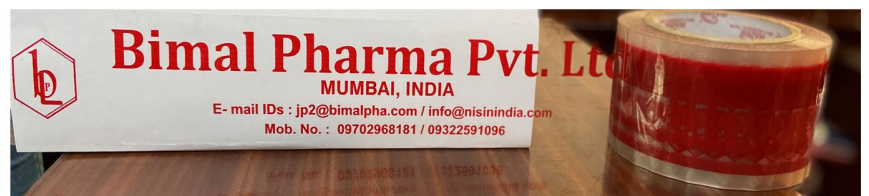
Printed Tape, with our Name & Logo, applied to seal the lids